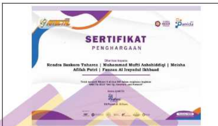
Lampiran V: Juara 3 AMICTA Universitas Amikom