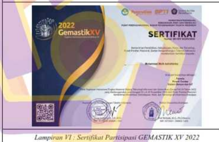
Lampiran VI: Sertifikat Partisipasi GEMASTIK XV 2022