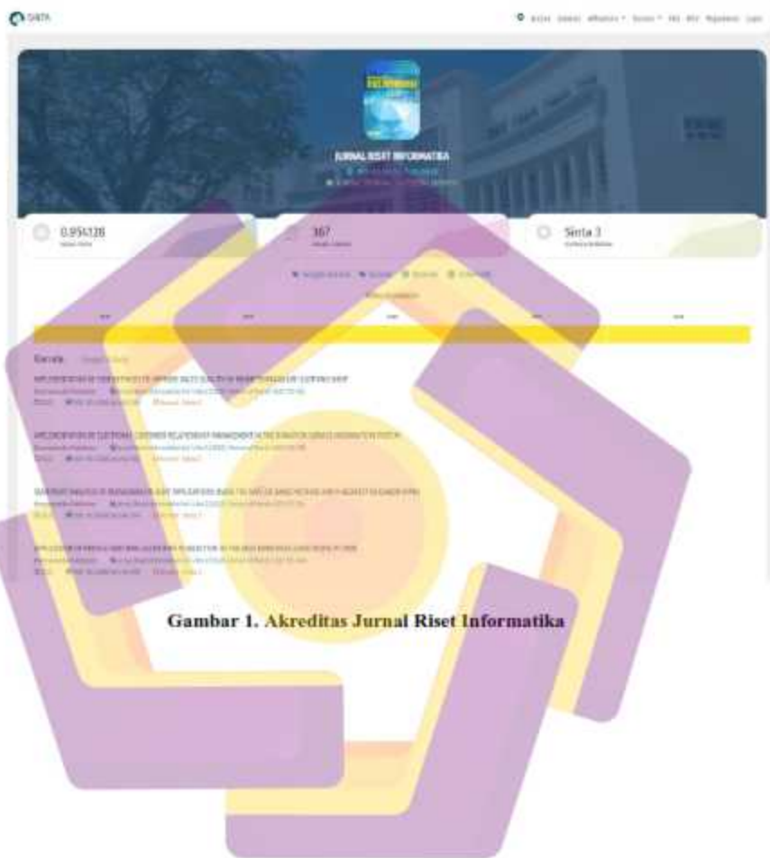
Gambar 1. Akreditasi Jurnal Riset Informatika